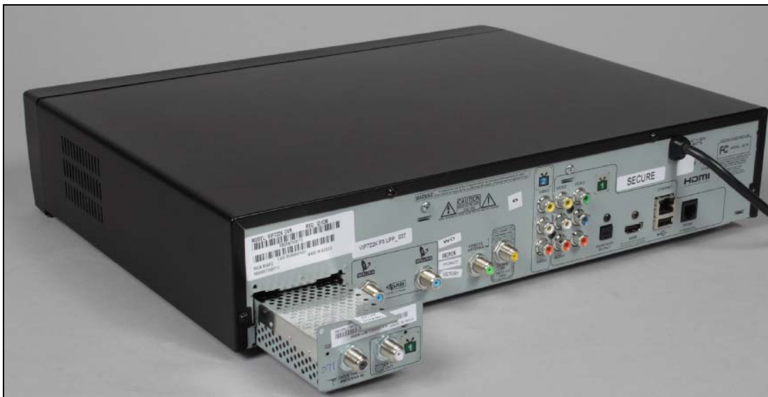
Rear panel of a ViP722k with an OTA module partially installed

The information in this document may change without notice.